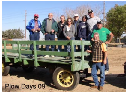
Plow Days 09