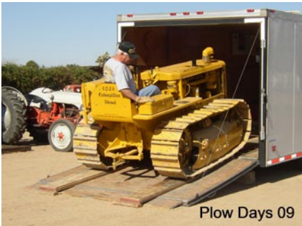
Plow Days 09

At the last club meeting at Dan Morgan's Plow Field, some members arrived early and brought Tractors and Crawlers. The following pictures are from that meeting.