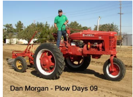
Dan Morgan - Plow Days 09