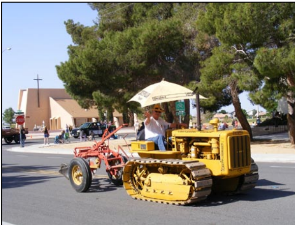
CLASSIC CATERPILLAR D2