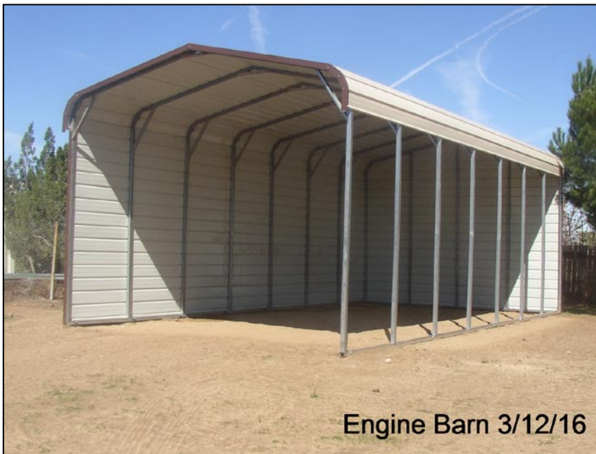
Engine Barn 3/12/16

In California you can attend a tractor show every weekend. Looking forward to attending the National Show June 10-12 in Alaska hosted by Branch 52. Take time to view our website periodically as there are changes being made. Review the safety rules that apply to you, safety does not take a day off.