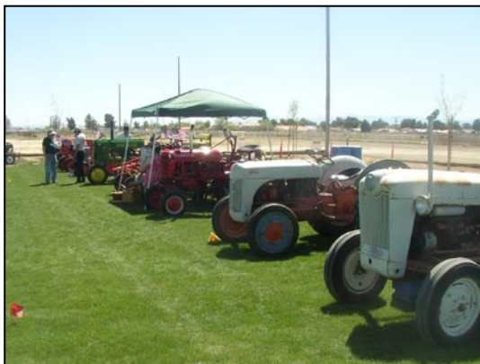
Thank You EDGE Branch 242 "Early Day Tractor & Iron", out of Hesperia, Ca. for bringing out tractors and helping us display, on very short notice. And yes - we had a tractor parade, on the lawn. The all children enjoyed the tractor's...