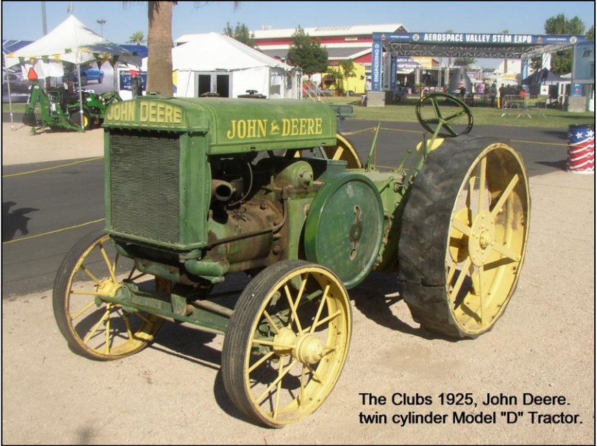
The Clubs 1925, John Deere. twin cylinder Model "D" Tractor.