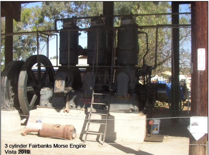
3 cylinder Fairbanks Morse Engine Vista 2019

Picture taken in 2019. Note the size of the piston at lower left.