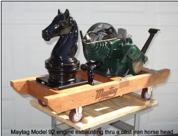
Maytag Model 92 engine exhausting thru a cast iron horses head

Bob Hanson's Model 92 Maytag two stroke engine, exhausting thru the nostrils of a cast iron horses head..... The more smoke the better! Bought the horses head at the Tulare show.