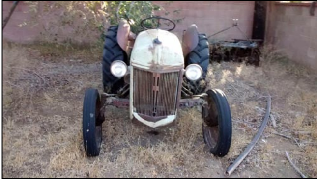
Ford 8N with attachments