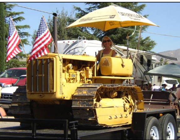
A nice picture of Maryln Ross in there 1939 D2 Caterpillar.....