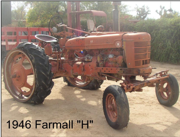
1946 Farmall "H"

Looks like this is the time of the year to buy yourself a "Christmas Present", like a Project Engine or Tractor.