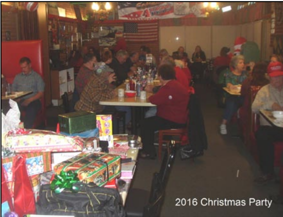
We had over 50 people in attendance enjoying a good get together.....