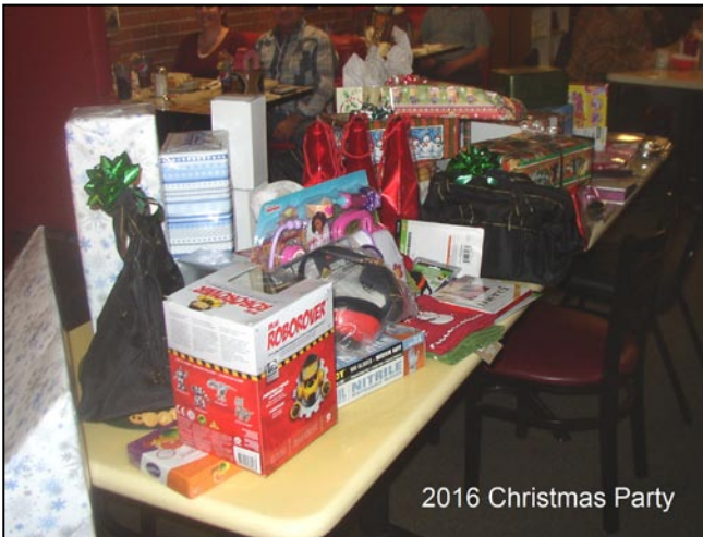
Pictured left, is our Christmas Gift table with lots of Xmas presents, to go around.....