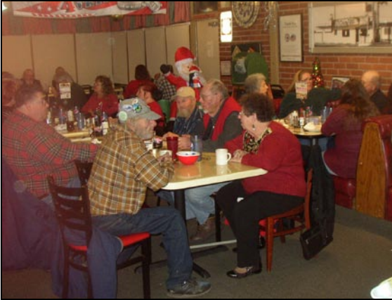
Everyone enjoying the evening with plenty of food & drink.....