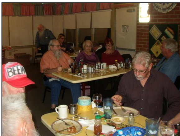
Club members, finishing their Christmas dinner.