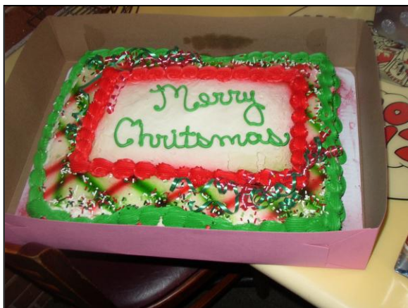
The Christmas Cake was "Delicious"