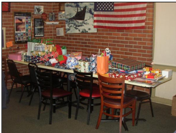
A Table of Christmas Gifts to give away....