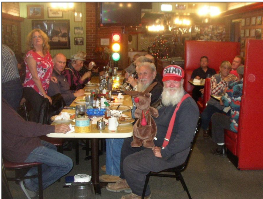
Just some of the Happy Faces