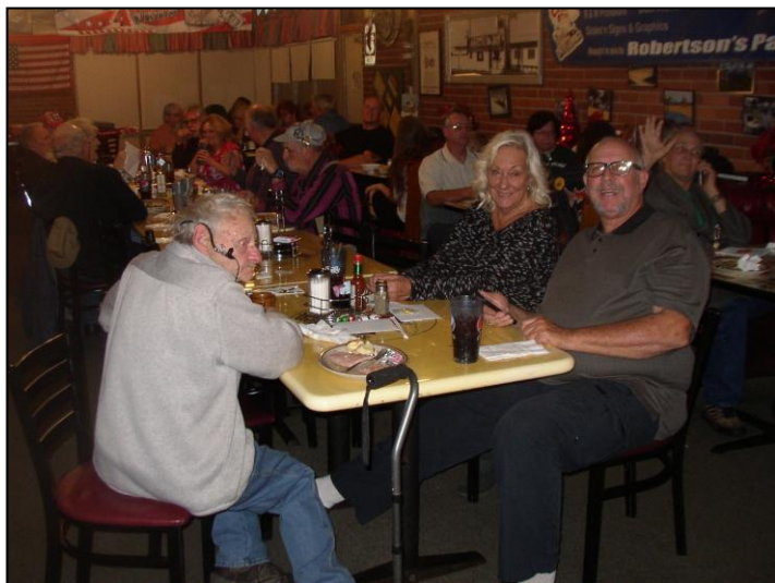
After dessert, getting ready to open gifts