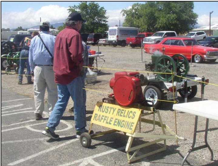
To sell Raffle Tickets, we brought the clubs 1 ½ HP, LB Engine. The raffle ticket will be drawn at Christmas.....