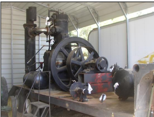
At the end of the day, the Fairbanks Engine is getting closer to de-grease, prime and spray paint. Belts & water pump removed.