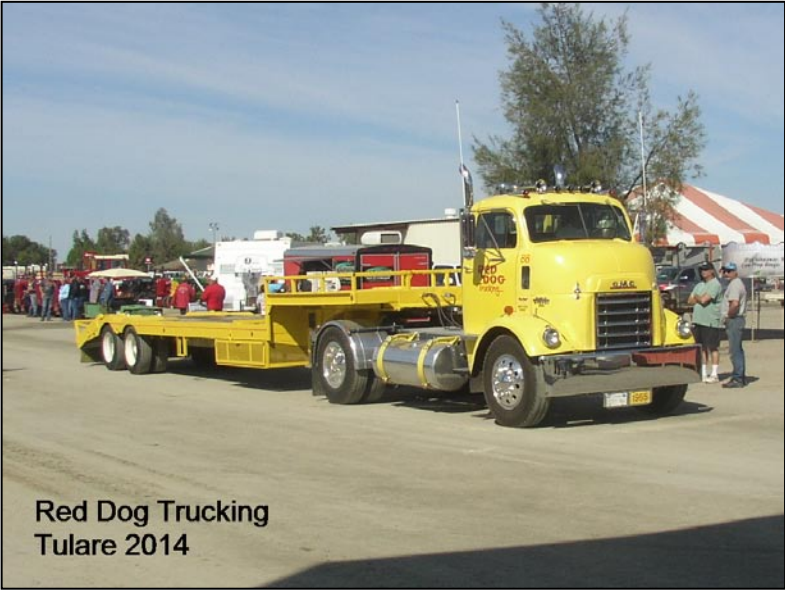
Red Dog Trucking Tulare 2014

The "Red Dog" Truck still lives on, as shown in the Tulare Parade.