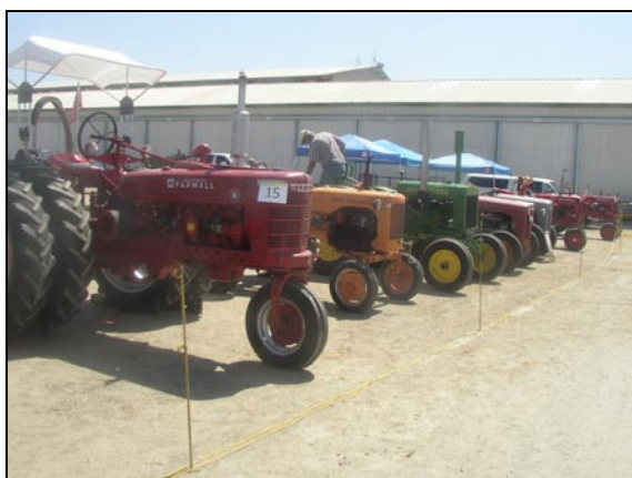
Tractor Row with a red Farmall, an orange Allis Chalmers, a green John Deere, a primer colored Ferguson, a gray color Ferguson and two red Farmall’s. With 2 garden tractors thrown in..... What a collection!