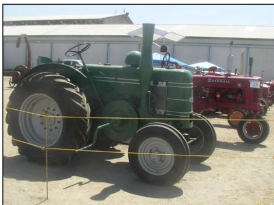
Pictured left is Carl's new 1949 Field Marshall Tractor, better known as the Shot Gun Engine. 40 HP, 2 Cycle Diesel Monster, weighing 7000 lbs.