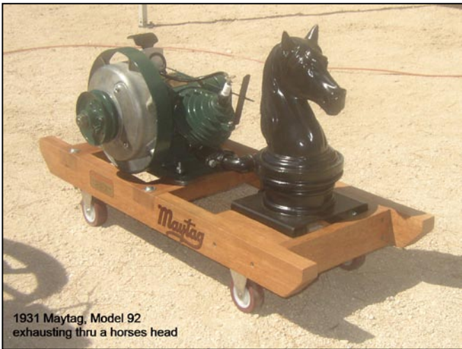
1931 Maytag, Model 92 exhausting thru a horses head