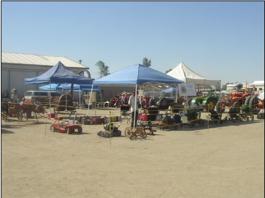
Our display booth at Tulare, April 17, 2015.