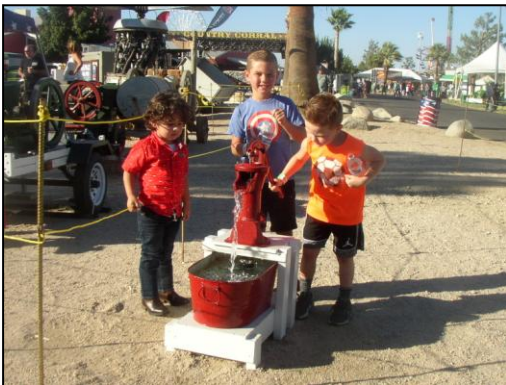
Editors picture of the year....

And for the children, taken at the 2018, Antelope Valley Fair.