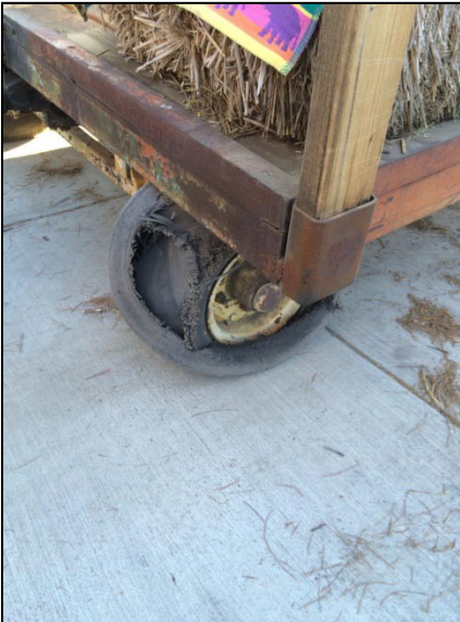
A picture of the hay wagon tire that didn't make it..... Made for a bumpy ride and shook the ladies up. I can see why.....flat on one side.